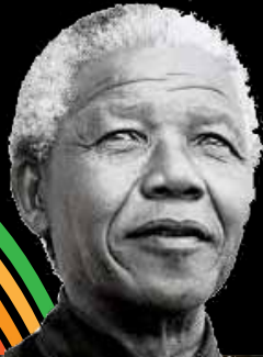
Nelson Mandela 1918 – 2013

"SPORT CAN REACH OUT THE PEOPLE IN A WAY WHICH POLITICIANS CAN'T"